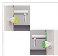
Water&Gas Remote Control