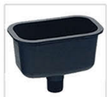
PP Sink resistant to acid, alkali and anti-corrosion